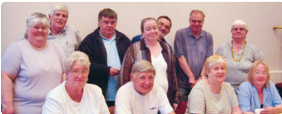
The Management Committee of Edinburgh Tenants Federation

TIS will be inviting nominations for the Frances Nelson Award 2011 in March, so please look out for further details. Tell us and we will tell everyone else about the great work of your group. Nominations will have to be returned to TIS by 29th April 2011.