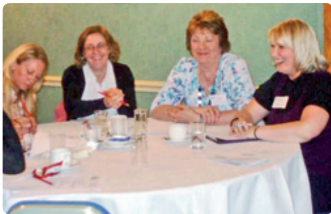
Tenant Participation Staff enjoy a workshop discussion

The conference highlighted that many landlords and their staff have a long way to go in understanding the issues associated with the Charter development and have a number of concerns regarding its implementation.